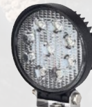
9 x 3W LED WORK LAMP

3 year warranty. "E" Marked. LED sealed beam technology with polycarbonate lens and sealed electronics.