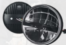
7" LED HEADLIGHTS

Powerful 6 x 10 watt 12/24 volt CREE LED flood light bar. 2 bolt tilt fixing bracket. 235 x 95 x 73mm.