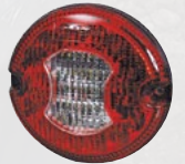
REAR LED LIGHTS

A robust 9 x 3 watt 12/24 volt LED work lamp. Low current draw. 1.5 amp at 12 volt dc. Protected to IP67. L 136 x W 114 x D 43.