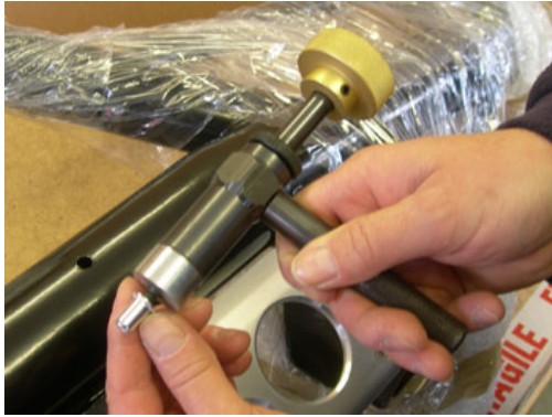
4) Fit the riv nut onto the setting tool and set.