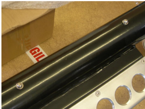
7) Finished job.

8) Now drill your number plate to match the hole centres of the set riv-nuts, do not over tighten the screws/bolts holding on the number plate.