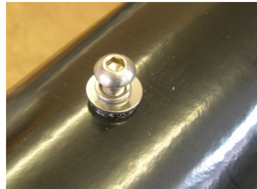
6) Test fit the screw / bolt.